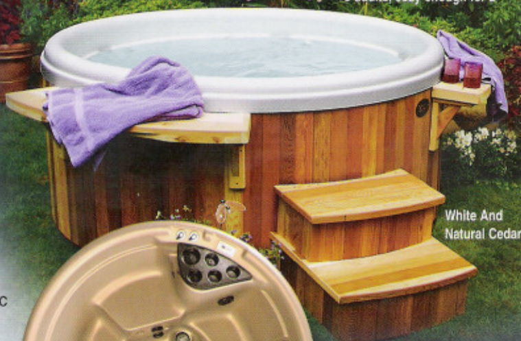
White And Natural Cedar

Nordic Crown II™. Room for 5 adults, cozy enough for 2