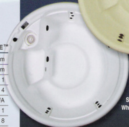
Nordic Impulse™/Impulse DP™ 14 Total Jets Seats Four White