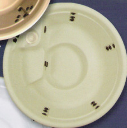
Nordic Sport™ 14 Total Jets Seats Five Sandstone