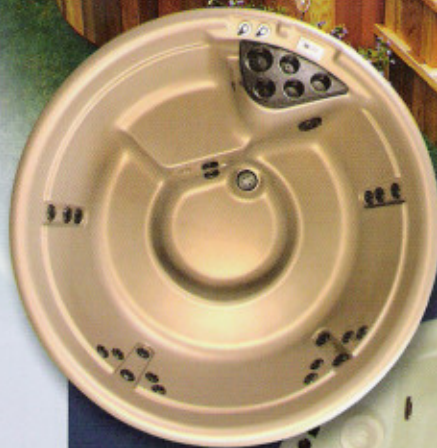
Nordic Crown II™ 21 Total Jets Seats Five Bronze Essence